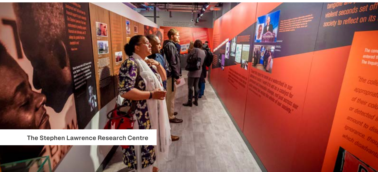
The Stephen Lawrence Research Centre

Our Stephen Lawrence Research Centre is dedicated to driving forward conversations that shape and influence how we think about race and social justice. Exploring the histories and cultures of black, Asian and minoratished communities in the UK, the concept and practice of institutional racism, denials of justice and the social psychology of racial violence, the centre honours the enduring legacy of Stephen Lawrence's life and his family's ongoing pursuit of justice.