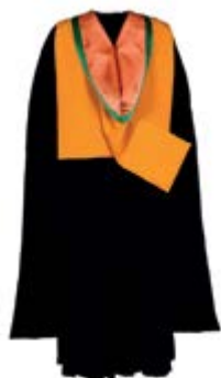
2. Master's degrees