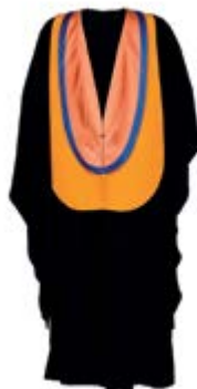
4. Bachelor's degrees