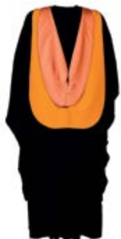
3. Postgraduate diplomas