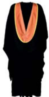
5. Foundation degrees