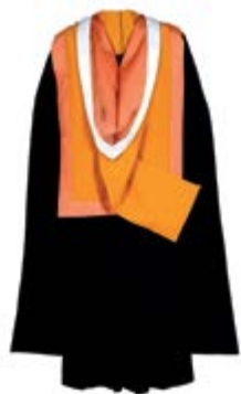
1. PhD degrees