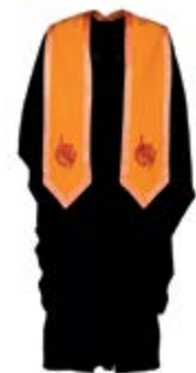
6. DMU licentiateship