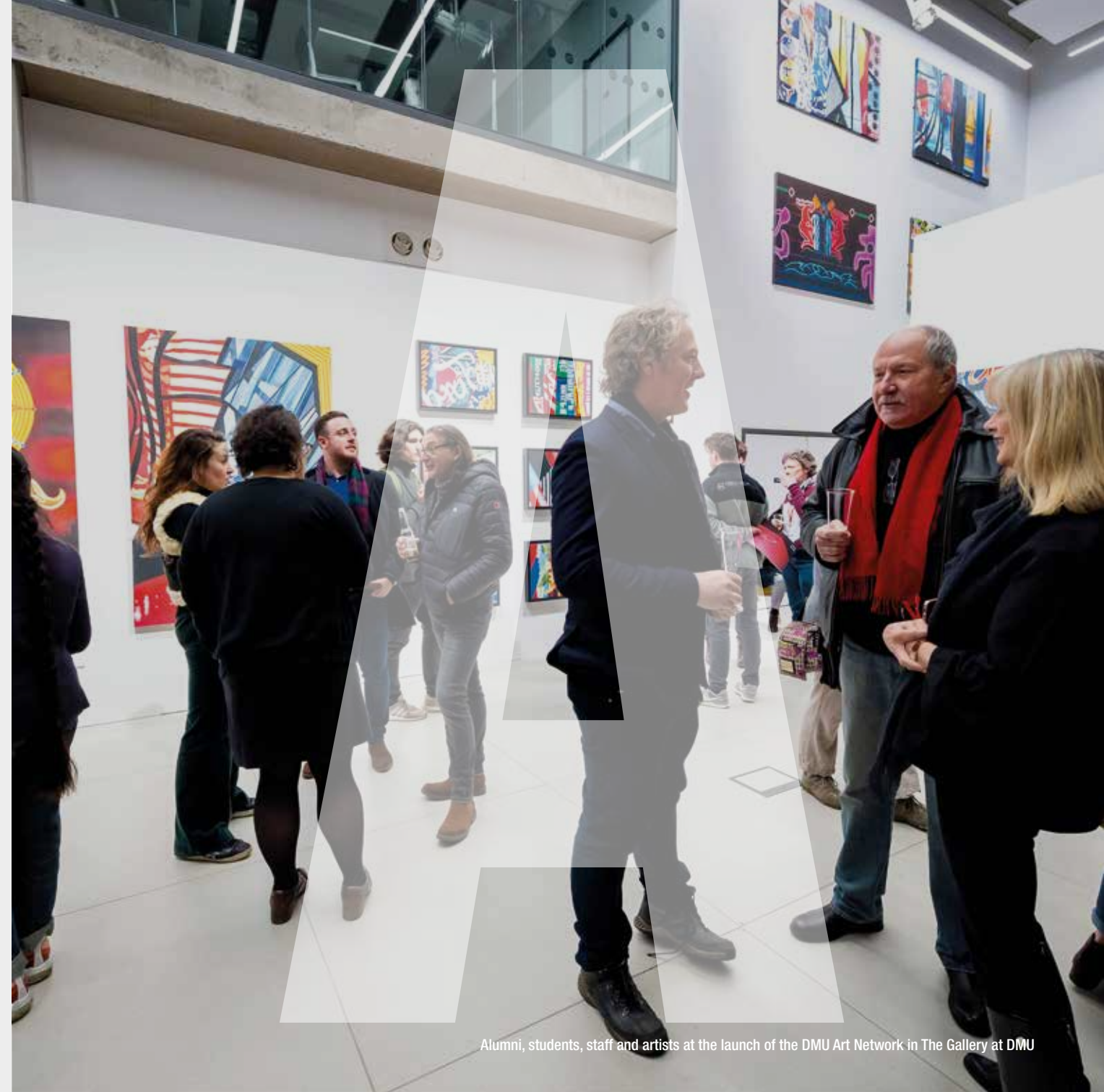
Alumni, students, staff and artists at the launch of the DMU Art Network in The Gallery at DMU