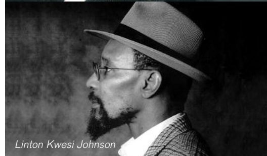
Linton Kwesi Johnson