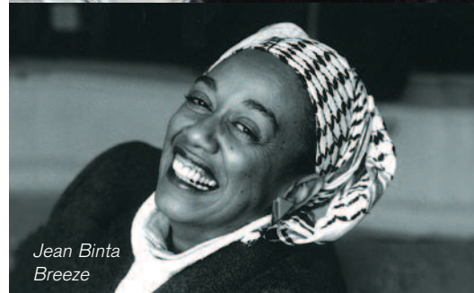
Jean Binta Breeze