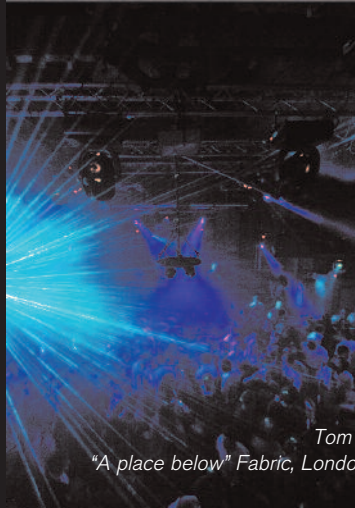
Tom Stapley "A place below" Fabric, London 2001