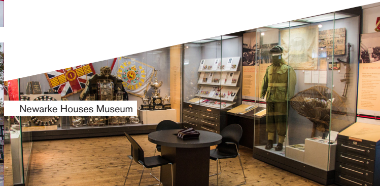
Newarke Houses Museum

Tea and coffee may be available at Newarke Houses Museum. Donations welcome.