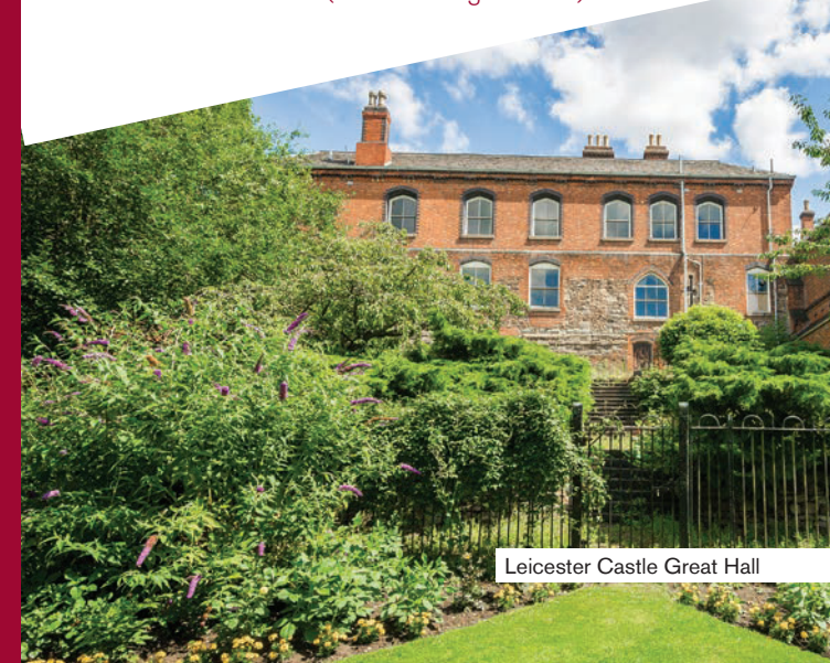
Leicester Castle Great Hall

2pm, Trinity Chapel and the ruins of the Church of the Annunciation (DMU Heritage Centre)