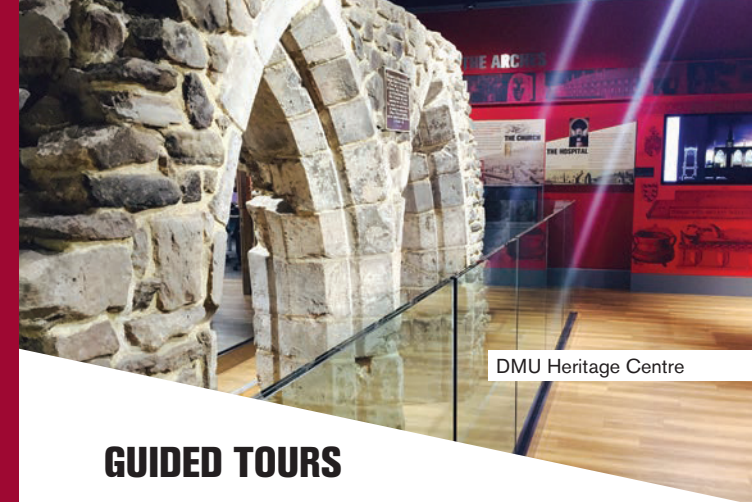
DMU Heritage Centre

For information on regular opening times go to visitleicester.info