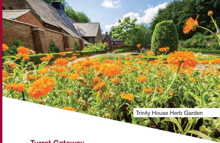
Trinity House Herb Garden