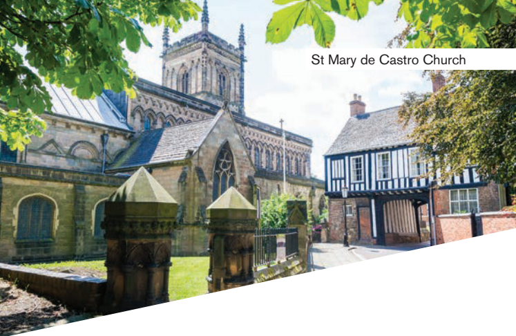
St Mary de Castro Church

Clustered around The Newarke and De Montfort University campus, just minutes from the city centre, are remarkable buildings that tell the story of Leicester from its medieval origins to its manufacturing heyday.