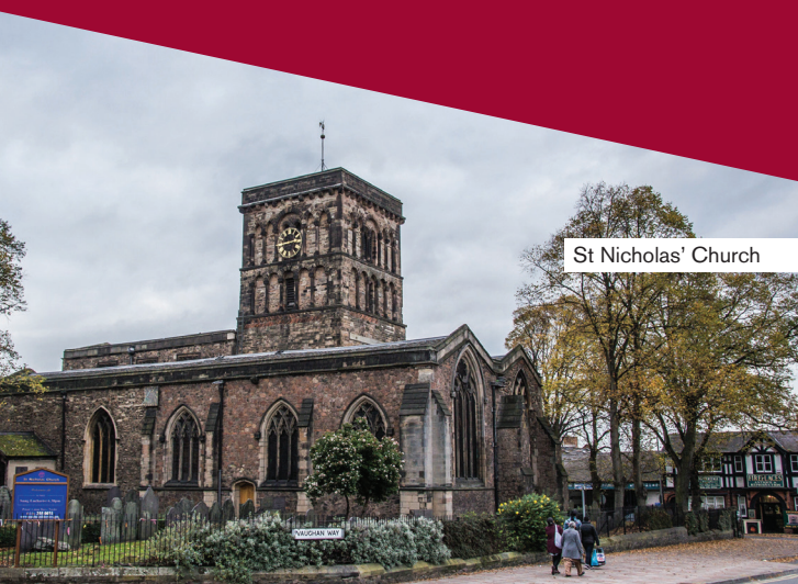
St Nicholas' Church

St. Nicholas', Leicester's oldest church. Guided tours from 11-3. Refreshments available. Take a stroll in the Roman town or visit the Bath Site with the Friends of Jewry Wall Museum. April-September only.