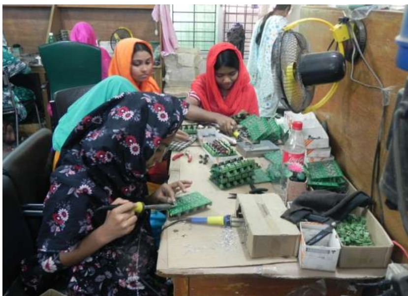
Figure 3: Women assembling solar charge controllers at an electronic unit in Dhaka