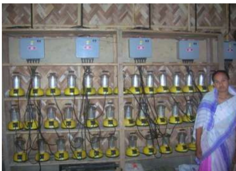
Figure 2: View of a typical solar charging station

22 states in India (as of December 2012), benefitting around 450,000 people, and has also taken its footprints to some countries in East and West Africa. LaBL operates on fee-for-service model where SCS or SDCMG are set-up in villages to provide lighting services. Figure 2 depicts the picture of a typical solar charging station with recharging facility for 50 lanterns. SELCO India, a social enterprise operating since 1995, has installed more than 0.1 million SHS mainly in the state of Karnataka. In addition, seventeen rural banks have also been financing SHS under the subsidy-cum-refinance scheme of MNRE implemented through National Bank for Agriculture and Rural Development, especially in grid connected areas with poor electricity supply. Most of these installations are in the states of Uttar Pradesh, Haryana, Madhya Pradesh, Karnataka and Gujarat.