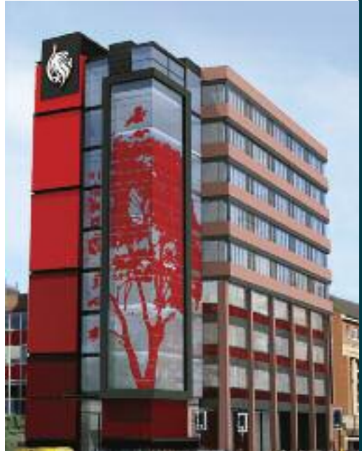
Edith Murphy House a new home for Health and Life Sciences

Her pioneering work has led to collaborations with other major research groups and companies to undertake the medical engineering and pre-clinical work, leading to production of a prototype suitable for regulatory approval for human use.